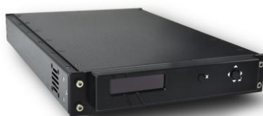
Indoor Unit (IDU)