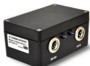
Outdoor/Remote Unit (ODU)

The most important thing we build is trust