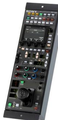
Camera Manufacturer's Standard RCP